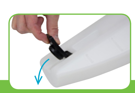
Empty the tank before storing it and empty the tank before refilling it.