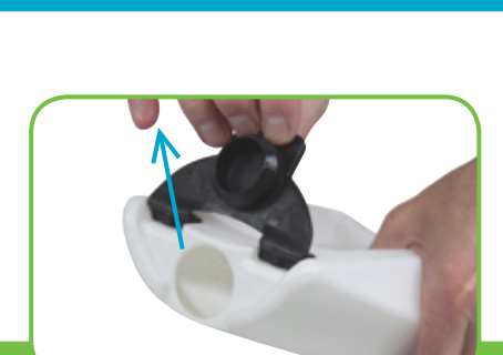
Leave the rubber cap open when storing overnight so