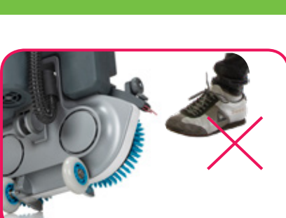
Do not kick the deck with foot. Gently